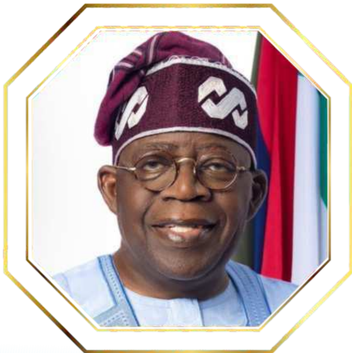
HIS EXCELLENCY, BOLA AHMED TINUBU GCFR PRESIDENT, COMMANDER-IN-CHIEF OF THE ARMED FORCES FEDERAL REPUBLIC OF NIGERIA